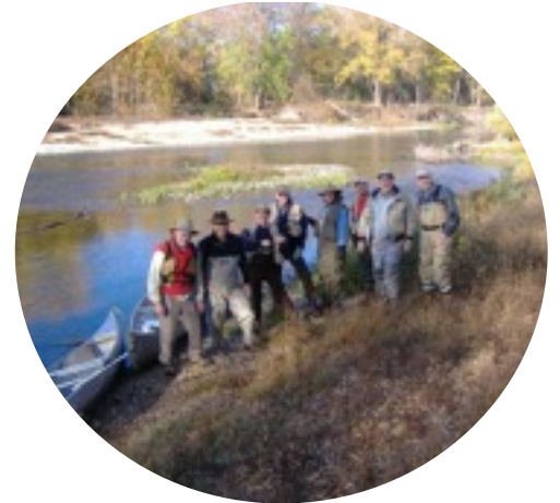
GCF AT THE ELK RIVER